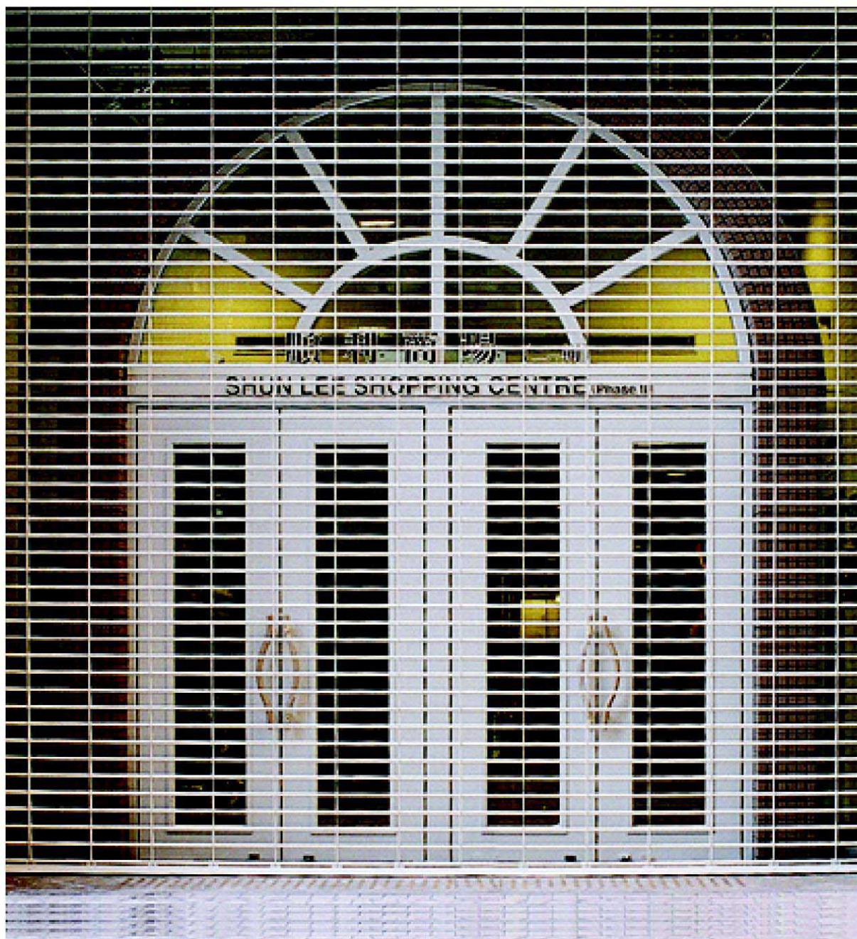
RLG 41 aluminium grille shutter with white colour powder coating.

Special Feature : • Built with wicket door