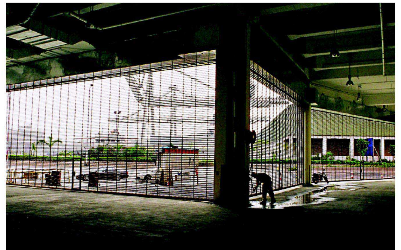
17000(W) x 6000(H) grille shutter with wicket door, KMB bus depot